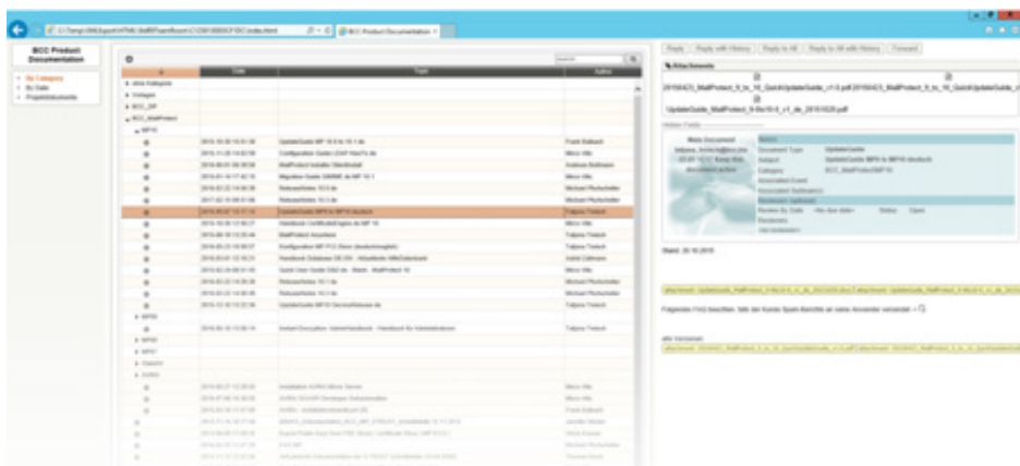
Standard Teamroom in Browser

The browser interface allows you to search in views, sort using the columns of the view, filtering and forwarding documents by mail in Outlook or Office Web Access.